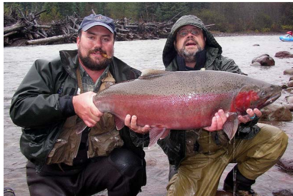
Flying in and unloading a raft on the Upper Copper River and a 44 x 23 inch Steelhead caught that day.