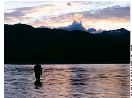
Fish as late as you want.