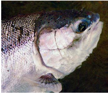
A hen Steelhead just in from the salt.