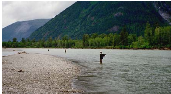
Fishing the main Skeena at tidewater.