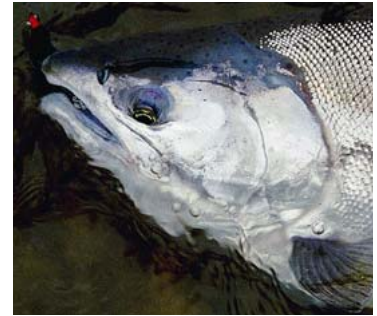
A bright Coho in ocean dress.