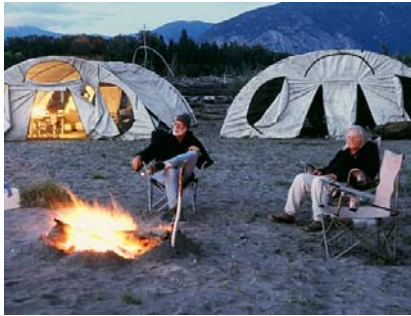
Relaxing after a hard day's fishing.