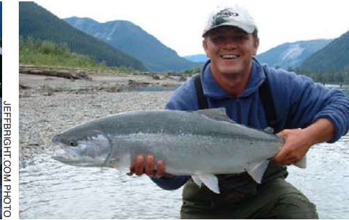
Steelhead still bearing sea lice.